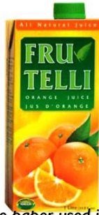
The paper used is a compliant material