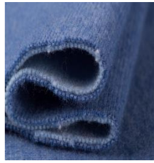
The fabric is a compliant material

Put learners in groups to sort out compliant materials from the variety of available materials.